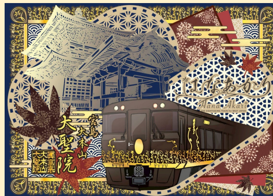
* The cut-out portions of the papercut art are colored dark blue for clarity.