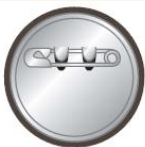
裏面 Back / 反面