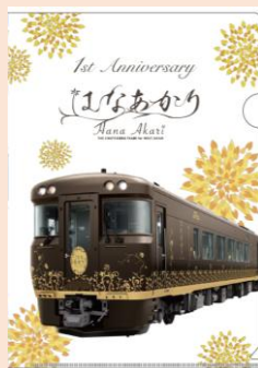
表面 / Front / 正面