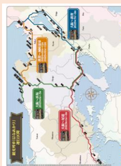
裏面 / Back / 反面