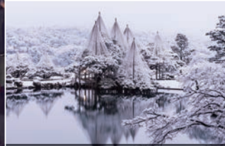
DAY 10 | Kenroku-en Garden