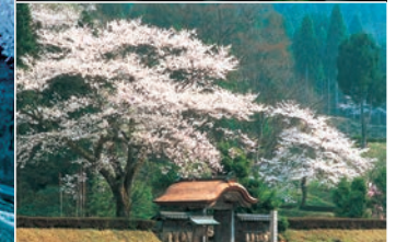
DAY 11 | Ichijodani Asakura Clan Ruins