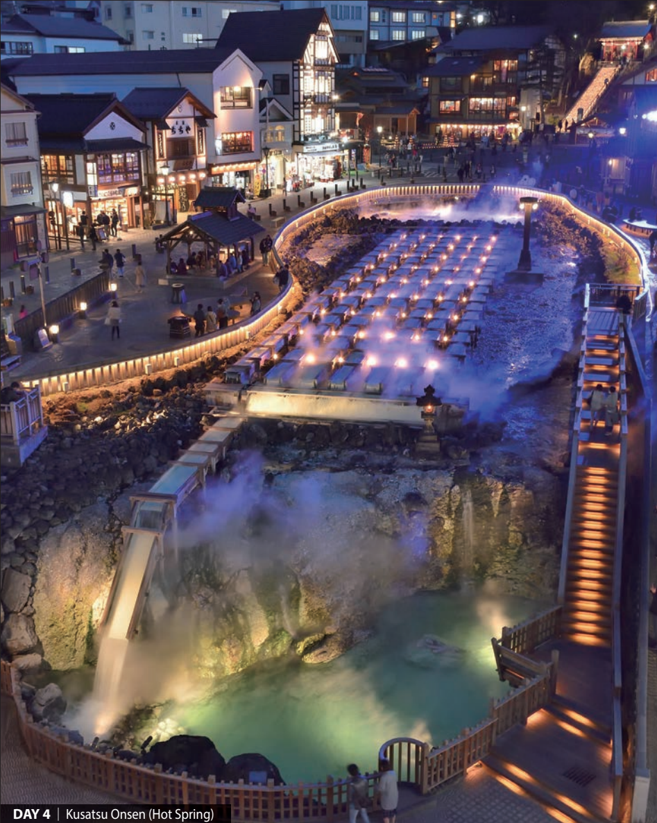
DAY 4 | Kusatsu Onsen (Hot Spring)