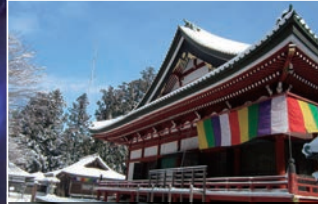
DAY 12 | Hieizan Enryaku-ji Temple