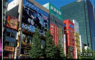
DAY 2 | Akihabara