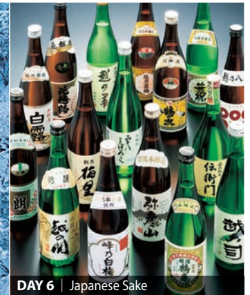
DAY 6 | Japanese Sake