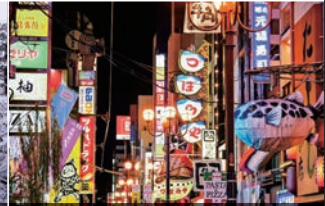
DAY 14 | Dotonbori Area