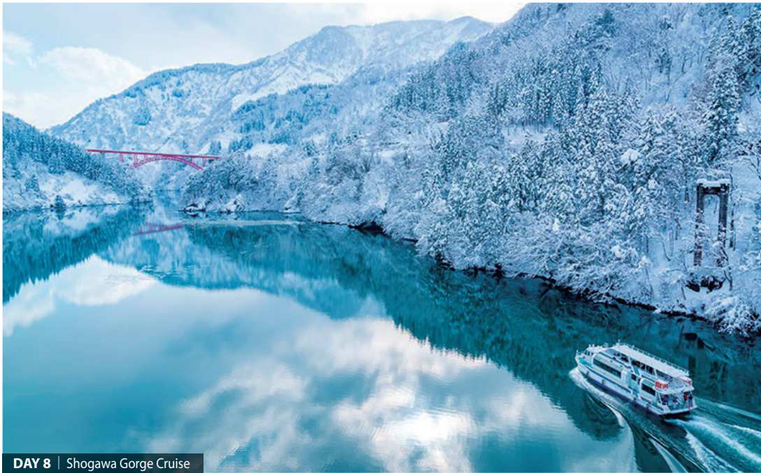
DAY 8 | Shogawa Gorge Cruise