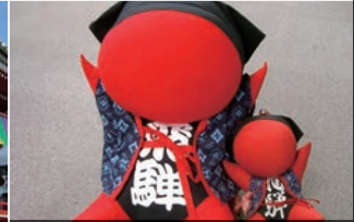
DAY 9 | Making Sarubobo doll