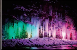
DAY 3 | Misotsuchi Icicles