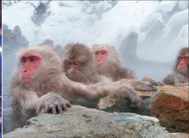
DAY 5 | Snow Monkeys / Jigokudani Yaen-koen