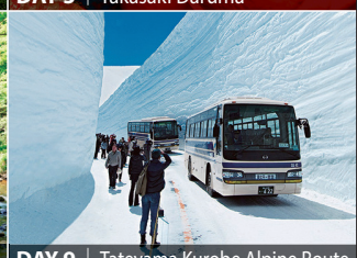
DAY 9 | Tateyama Kurobe Alpine Route