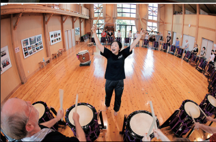
DAY 8 | Sado Island Taiko Center