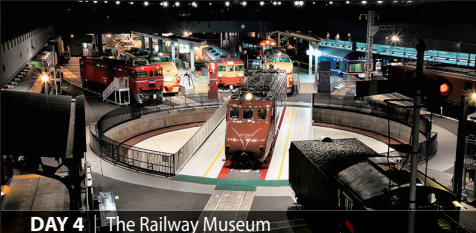
DAY 4 | The Railway Museum