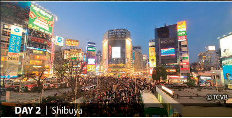
DAY 2 | Shibuya