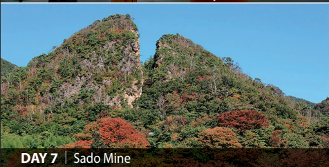
DAY 7 | Sado Mine