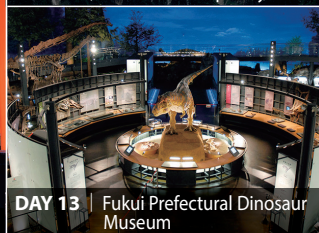
DAY 13 | Fukui Prefectural Dinosaur Museum