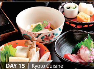
DAY 15 | Kyoto Cuisine