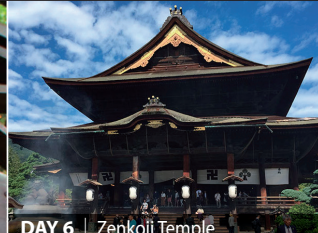
DAY 6 | Zenkoji Temple