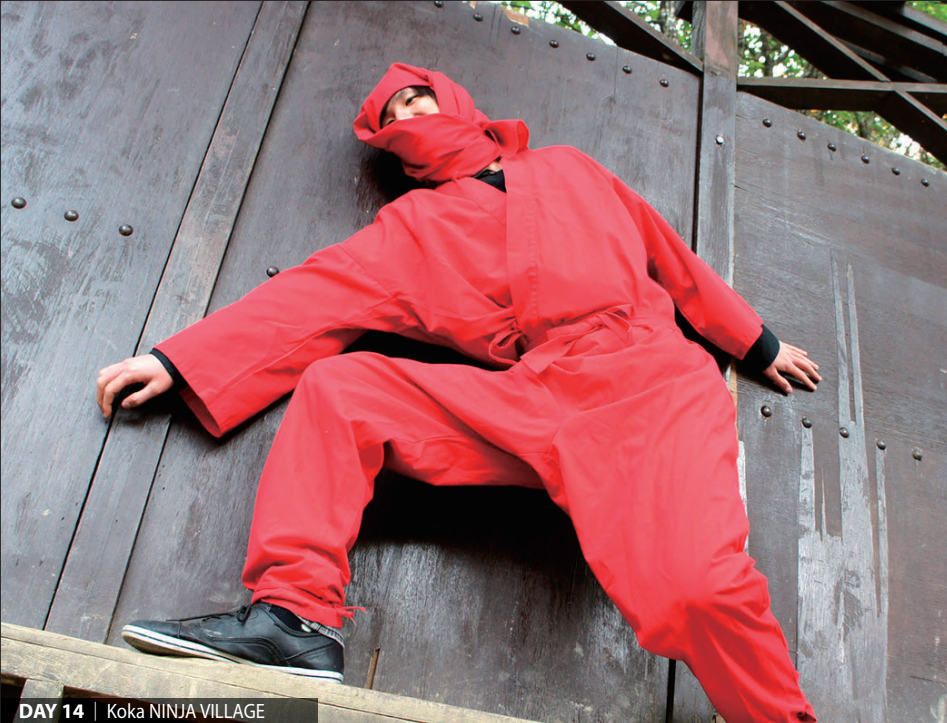
DAY 14 | Koka NINJA VILLAGE