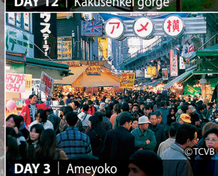
DAY 3 | Ameyoko