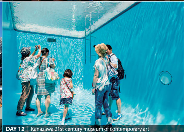
DAY 12 | Kanazawa 21st century museum of contemporary art