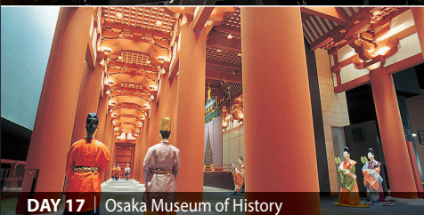
DAY 17 | Osaka Museum of History