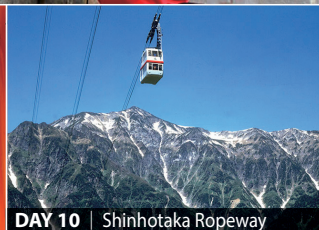
DAY 10 | Shinhotaka Ropeway