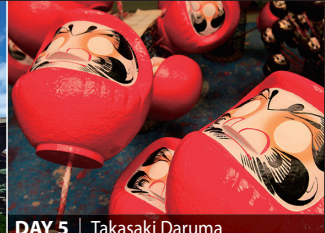
DAY 5 | Takasaki Daruma