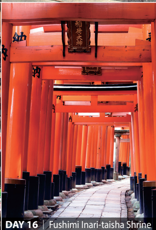
DAY 16 | Fushimi Inari-taisha Shrine