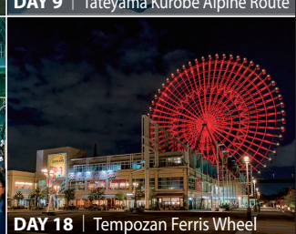
DAY 18 | Tempozan Ferris Wheel