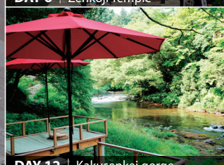
DAY 12 | Kakusenkei gorge