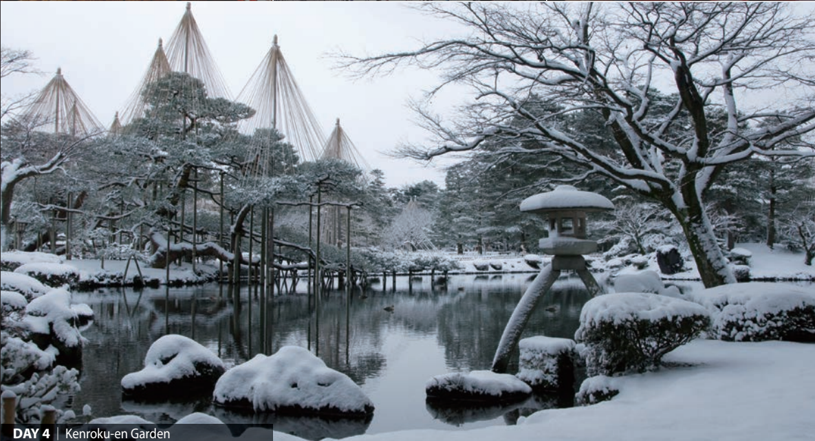
DAY 4 | Kenroku-en Garden