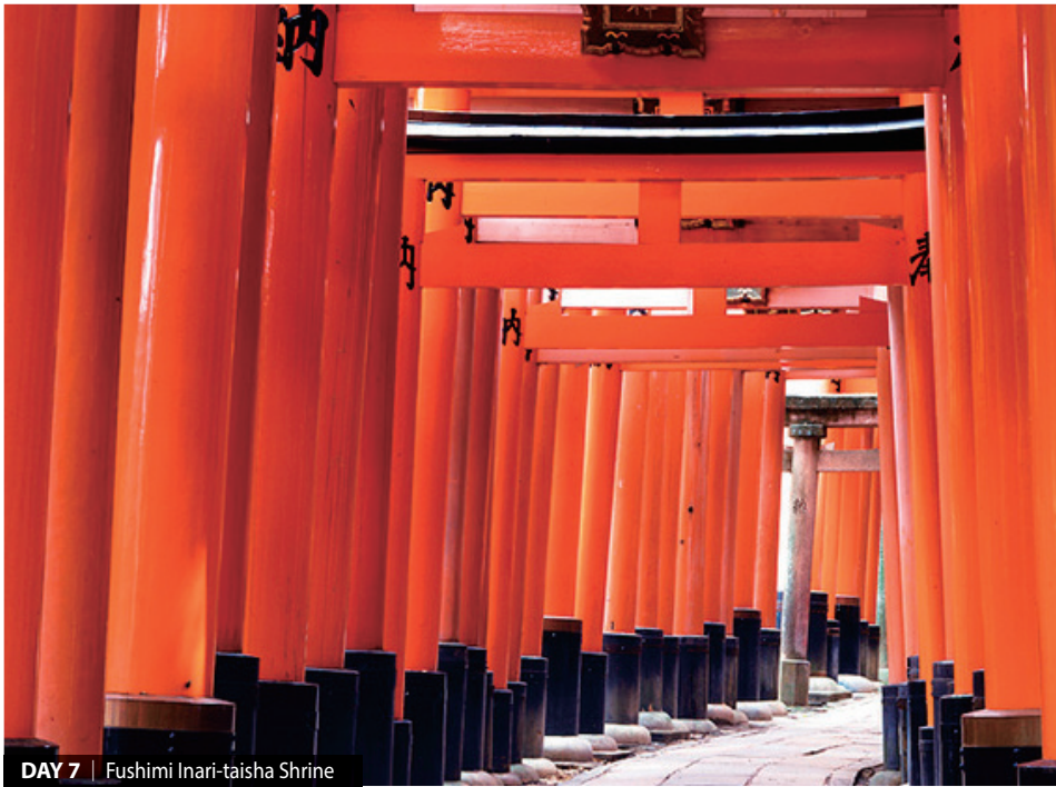
DAY 7 | Fushimi Inari-taisha Shrine