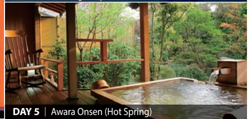
DAY 5 | Awara Onsen (Hot Spring)