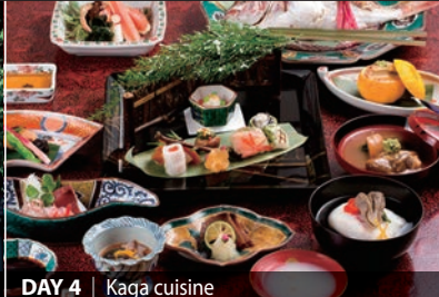
DAY 4 | Kaga cuisine