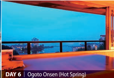
DAY 6 | Ogoto Onsen (Hot Spring)