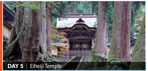
DAY 5 | Eihei-ji Temple