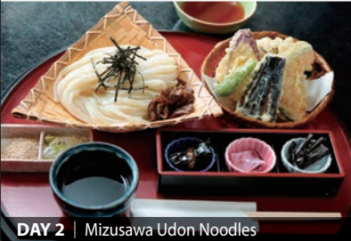
DAY 2 | Mizusawa Udon Noodles