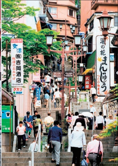
DAY 2 | Iikaho Onsen (Hot Spring)