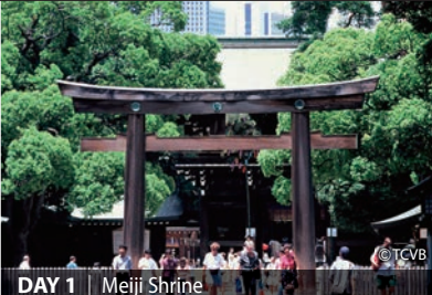
DAY 1 | Meiji Shrine