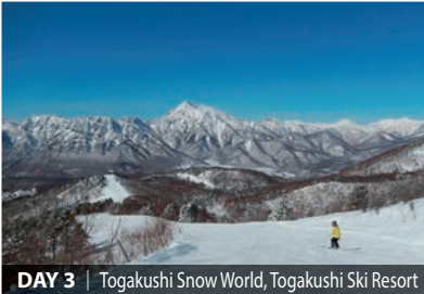
DAY 3 | Togakushi Snow World, Togakushi Ski Resort