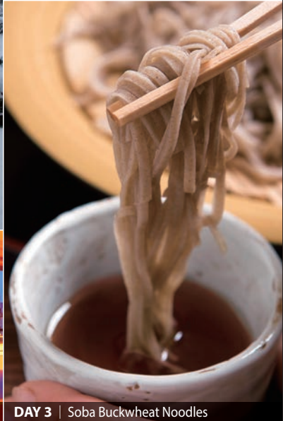
DAY 3 | Soba Buckwheat Noodles