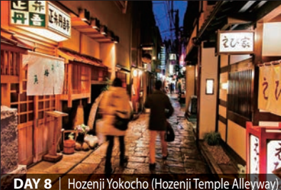
DAY 8 | Hozenji Yokocho (Hozenji Temple Alleyway)