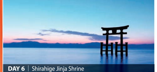
DAY 6 | Shirahige Jinja Shrine