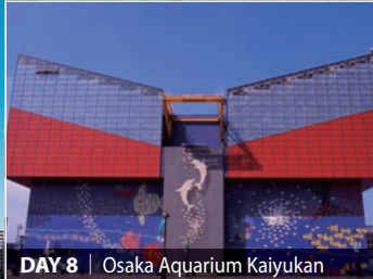
DAY 8 | Osaka Aquarium Kaiyukan