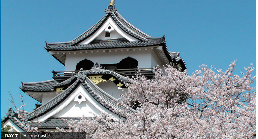
DAY 7 | Hikone Castle