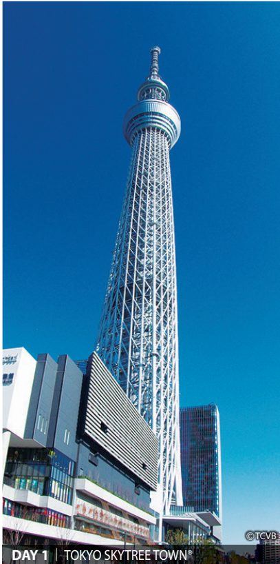
DAY 1 | TOKYO SKYTREE TOWN®