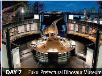
DAY 7 | Fukui Prefectural Dinosaur Museum