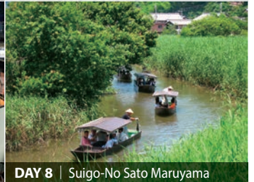
DAY 8 | Suigo-No Sato Maruyama