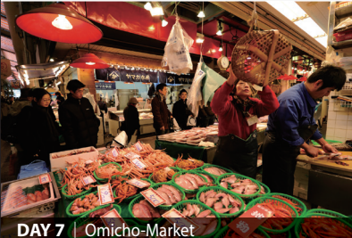
DAY 7 | Omicho-Market