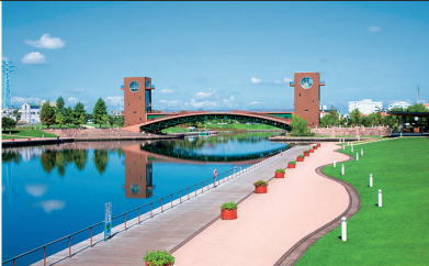
DAY 5 | Fugan Unga Kansui Park(Fugan Canal Park)