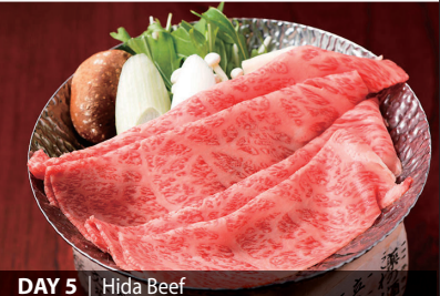
DAY 5 | Hida Beef