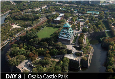
DAY 8 | Osaka Castle Park