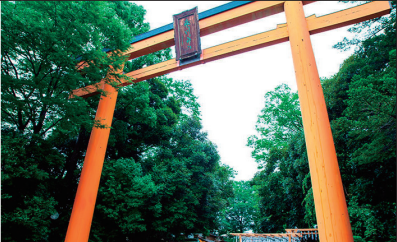
DAY 2 | Kawagoe Hikawa Shrine