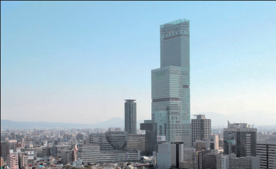
DAY 8 | Abeno Harukas Kintetsu Main Store