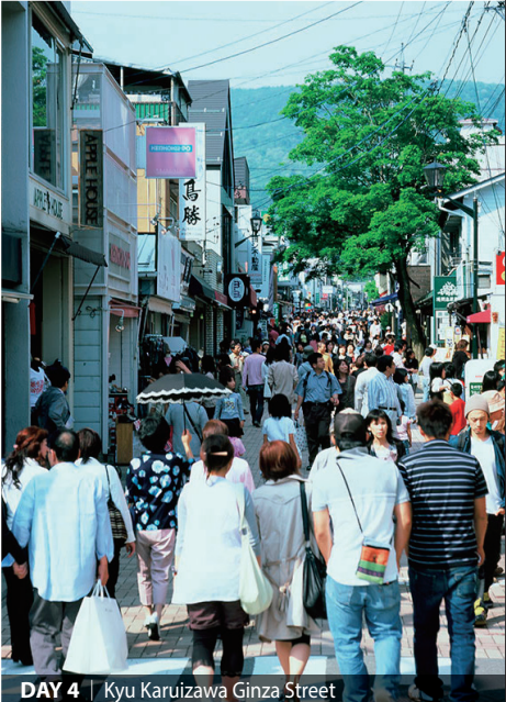
DAY 4 | Kyu Karuizawa Ginza Street