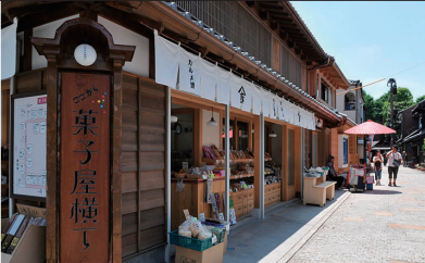
DAY 2 | Penny Candy Alley