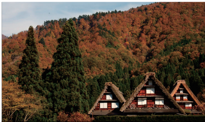
DAY 6 | World Heritage Shirakawa-go Gassho-zukuri Village