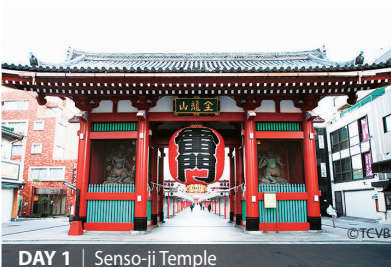
DAY 1 | Senso-ji Temple