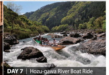
DAY 7 | Hozu-gawa River Boat Ride