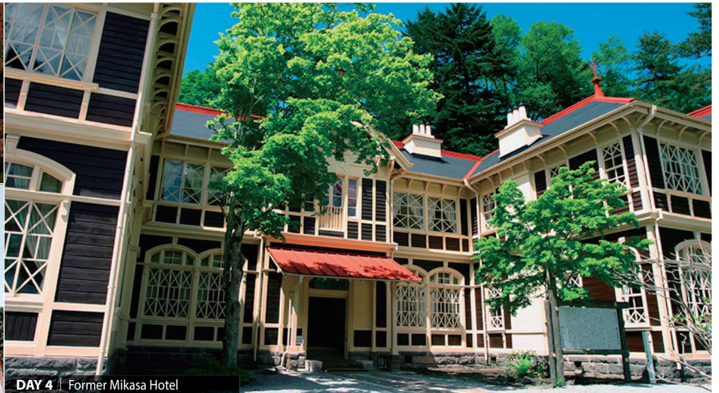
DAY 4 | Former Mikasa Hotel