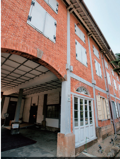
DAY 3 | Tomioka Silk Mill