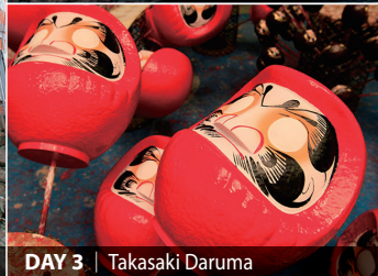
DAY 3 | Takasaki Daruma