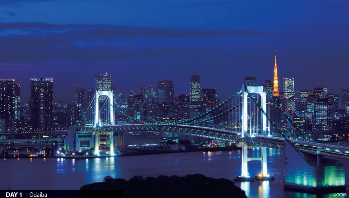
DAY 1 | Odaiba