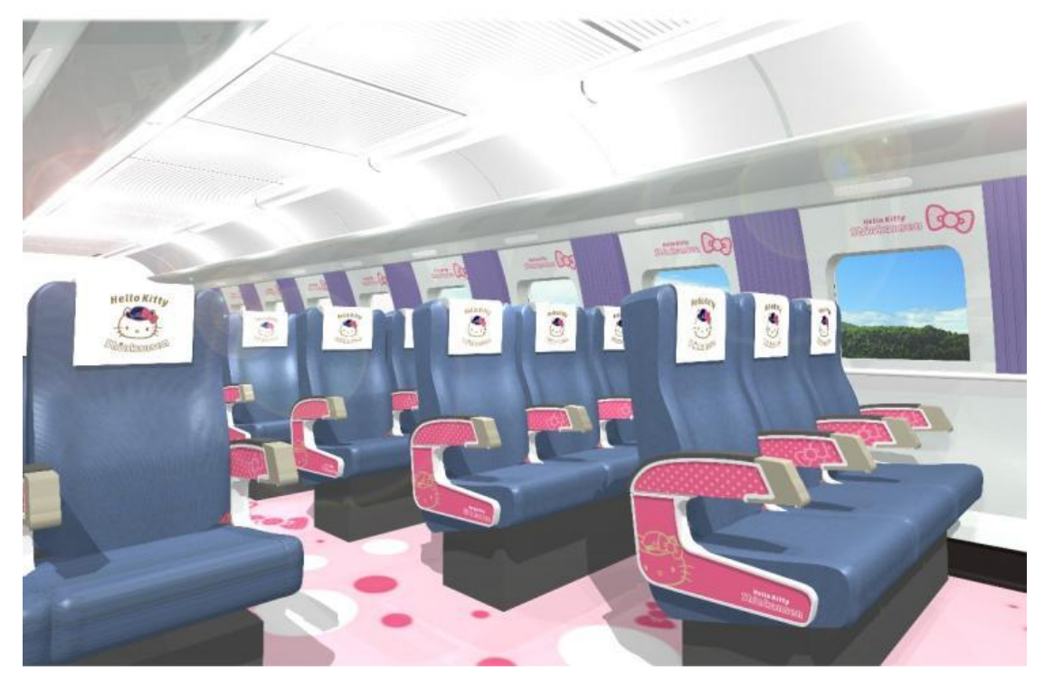
Car 2 is "KAWAII! ROOM," which features a Hello Kitty design. This room was specially designed for passengers travelling on the Hello Kitty Shinkansen. There is a photo spot for taking commemorative photographs with a Hello Kitty travel guide. Hello Kitty is also hidden somewhere in this car so please come on board and look for her.