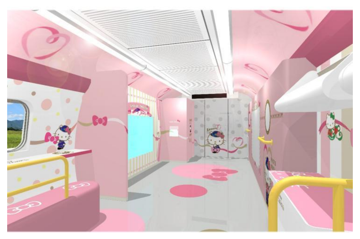
Car 1 is "HELLO! PLAZA," which presents information on the regions of western Japan on a limited-time basis. There are also special facilities that can only be found here, including shop space where you can purchase limited-edition goods and regional specialty products, space where you can relax and enjoy the scenery, an image corner where you can view regional attractions, etc.