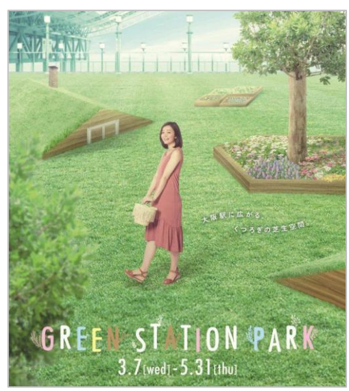
[Main visual for event]

Note: Please see attachment for details.