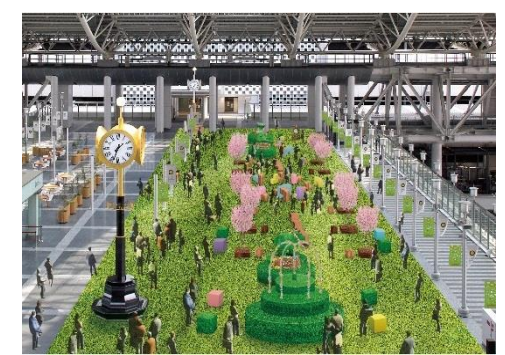
Artist rendering of event site