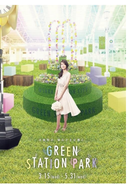
Main visual for event