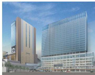
(3) New station building development