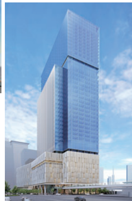
(4) Development of the area west of Osaka Station