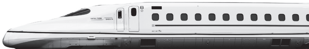
New rolling stock for direct services between the Sanyo and the Kyushu Shinkansen