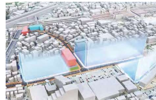
Nishi-Akashi Station south district

Integrating solutions to regional issues in partnership with the city of Akashi while realizing a convenient, livable community by taking advantage of our wide-area rail network