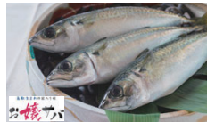
"Ojosaba" mackerel raised in Tottori Prefecture