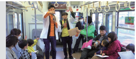
On the Food & Train tour

Actively promoting and advertising attractions along our train lines supports our ability to provide safe and sustainable railway operation and transportation services.