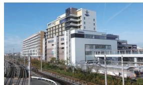
VIERRA Kishibe Kento

function" in line with the Kento concept and to serve a "lifestyle convenience function" for the local population.