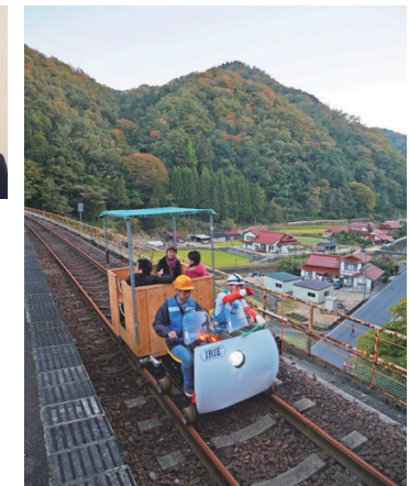
The trolley car on the former Uzui Station tracks