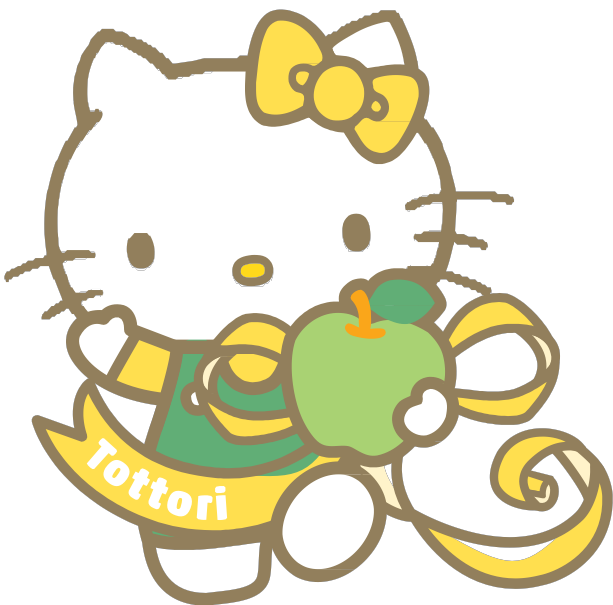
The Tottori Prefecture Hello Kitty

Car 1 will have limited period displays showcasing the various regions of western Japan. First up will be the Sanin Destination Campaign featuring Shimane and Tottori prefectures. Regional Hello Kitty characters for both the prefectures will help with the PR!