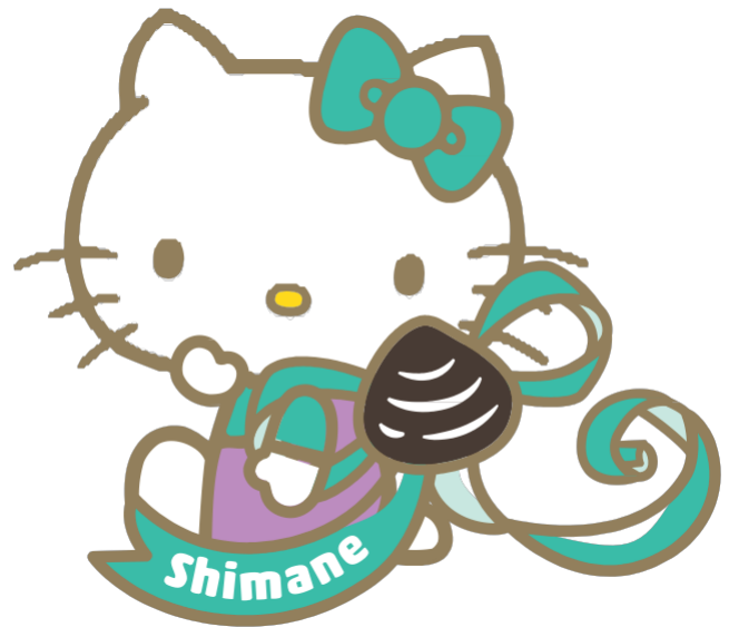
The Shimane Prefecture Hello Kitty

You can look forward to seeing regional Hello Kitty characters for other prefectures as well!