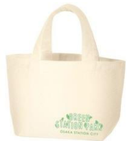
【 Tote bag 】

Reception area: • North Gate Building 3F, Osaka Station City information (10:00-20:00)