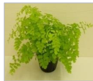
【 Plant 】

Reception area: • 5th floor, near stage in Toki-no-Hiroba Plaza