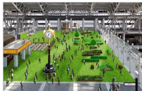
【Artist rendering of event site】

Note: Please see attachment for details.