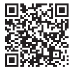
Train operating status