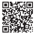
Train operating status