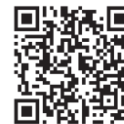
How to use JR-WEST