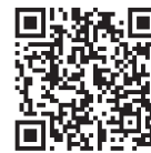
How to use JR-WEST