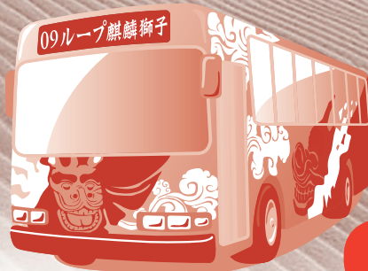
LOOP KIRINJISHI BUS

If you buy a 1day pass, you can leave your baggage for free.