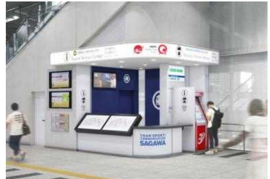
< Exterior Image >